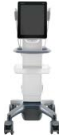
Simple | Focused | Smart

Touch Screen Ultrasound System Simple | Focused | Smart