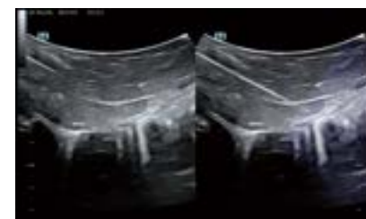
iNeedle+ on convex